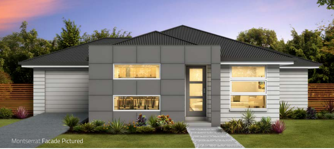
Montserrat Facade Pictured