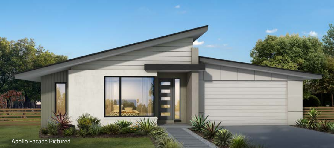
Apollo Facade Pictured